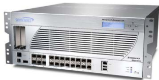
SuperMassive E10800 Next-Generation Firewall